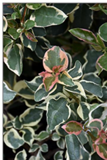
Bengal Orange Bougainvillea foliage