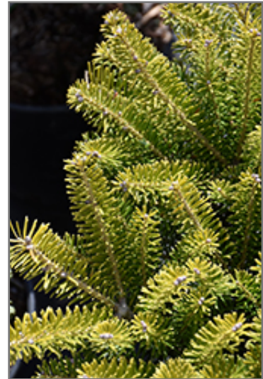
Golden Glow Korean Fir foliage

Golden Glow Korean Fir will grow to be about 6 feet tall at maturity, with a spread of 12 feet. It tends to fill out right to the ground and therefore doesn't necessarily require facer plants in front, and is suitable for planting under power lines. It grows at a slow rate, and under ideal conditions can be expected to live for 60 years or more.