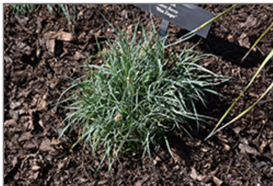
Blue Zinger Blue Sedge