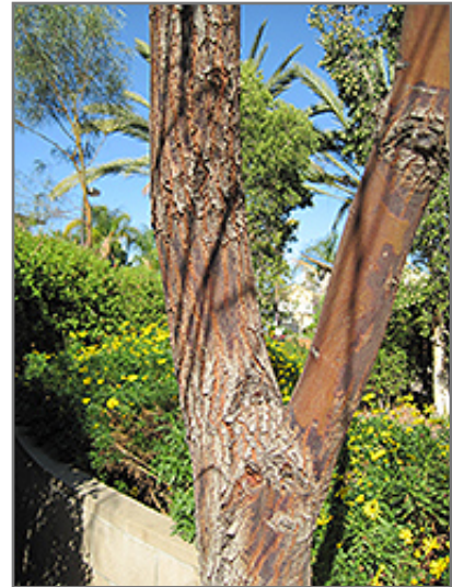
Shoestring Acacia bark

This plant is not reliably hardy in our region, and certain restrictions may apply; contact the store for more information.