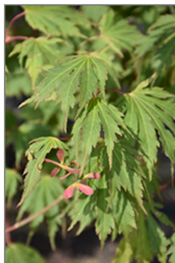
Northern Glow Maple foliage