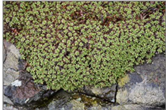
Cushion Bolax

Cushion Bolax is recommended for the following landscape applications;