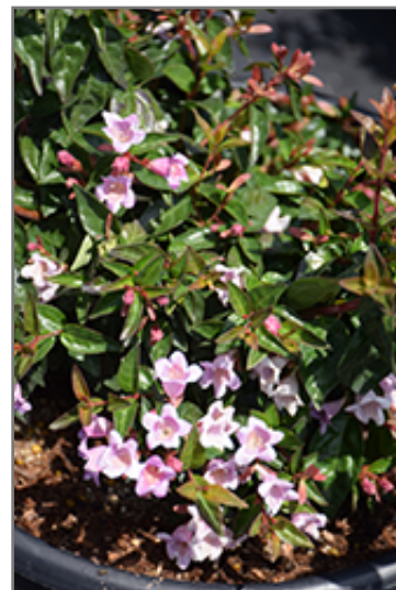
Sunrise Abelia flowers

This plant is not reliably hardy in our region, and certain restrictions may apply; contact the store for more information.