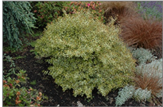
Sunrise Abelia

This shrub will require occasional maintenance and upkeep, and is best pruned in late winter once the threat of extreme cold has passed. It is a good choice for attracting birds, bees and butterflies to your yard, but is not particularly attractive to deer who tend to leave it alone in favor of tastier treats. It has no significant negative characteristics.