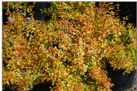
Sunrise Abelia