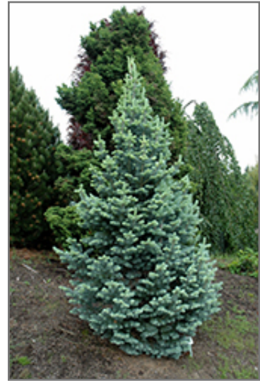
Compact Alpine Fir