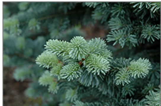
Compact Alpine Fir foliage