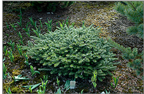
Flying Saucer Korean Fir

Flying Saucer Korean Fir will grow to be about 24 inches tall at maturity, with a spread of 5 feet. It tends to fill out right to the ground and therefore doesn't necessarily require facer plants in front. It grows at a slow rate, and under ideal conditions can be expected to live for 60 years or more.