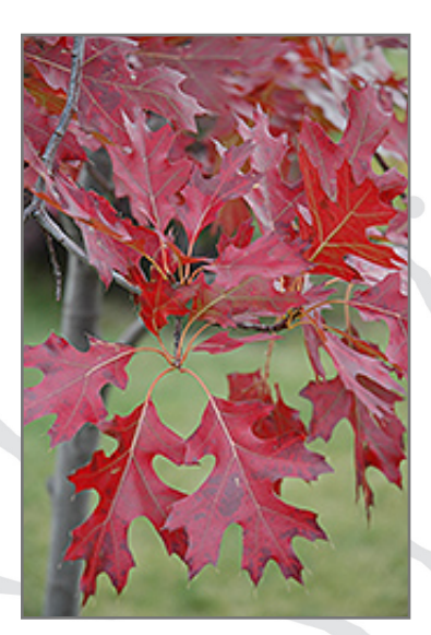
Northern Pin Oak in fall