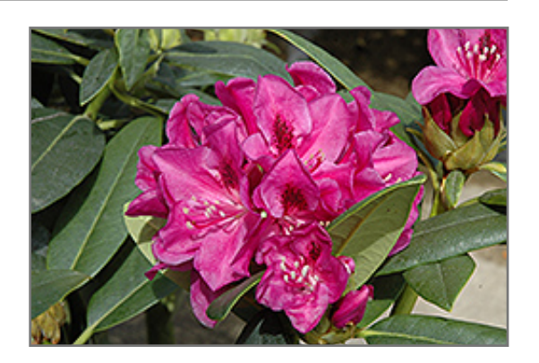
Wojnar's Purple Rhododendron flowers

Wojnar's Purple Rhododendron will grow to be about 5 feet tall at maturity, with a spread of 5 feet. It tends to be a little leggy, with a typical clearance of 1 foot from the ground, and is suitable for planting under power lines. It grows at a slow rate, and under ideal conditions can be expected to live for 40 years or more.