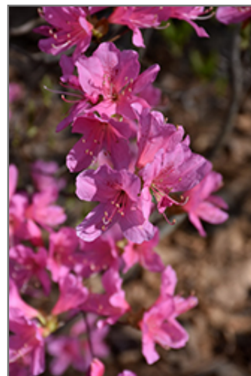
Netted Azalea flowers

Netted Azalea will grow to be about 4 feet tall at maturity, with a spread of 4 feet. It tends to be a little leggy, with a typical clearance of 1 foot from the ground. It grows at a slow rate, and under ideal conditions can be expected to live for 40 years or more.