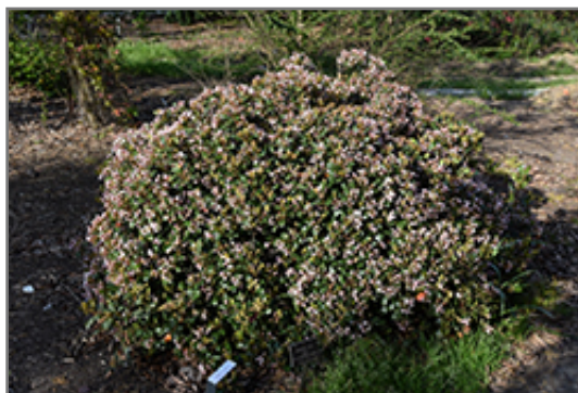
Eleanor Taber Indian Hawthorn in bloom