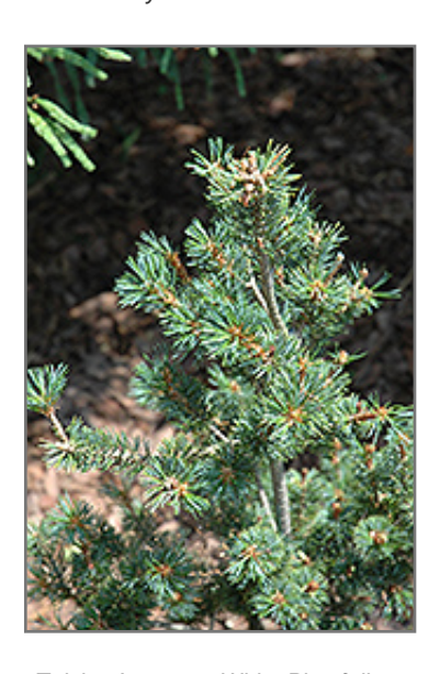
Zuisho Japanese White Pine foliage