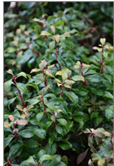
Bisbee Dwarf Japanese Pieris foliage