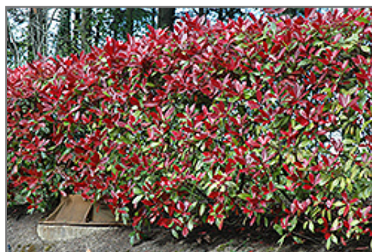
Red Robin Photinia