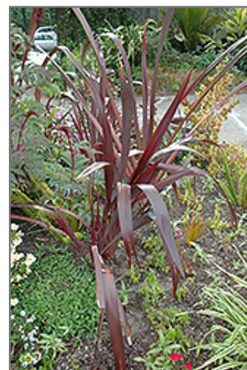
Amazing Red New Zealand Flax foliage