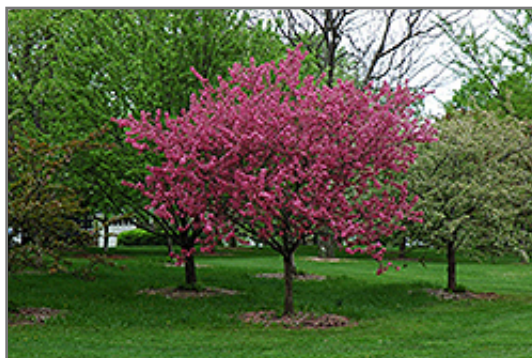
Prairifire Flowering Crab in bloom