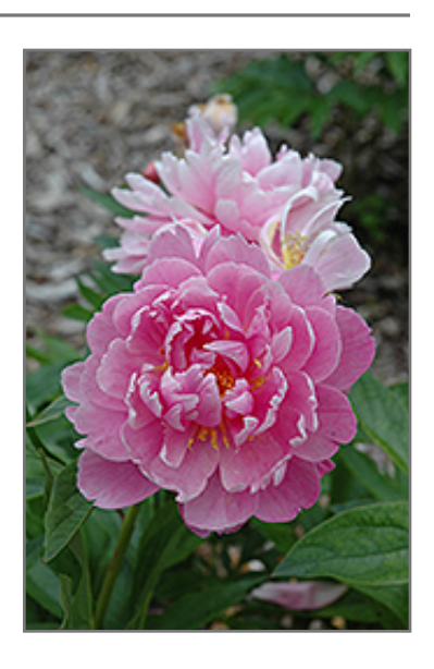
Faustine Peony flowers

Faustine Peony will grow to be about 30 inches tall at maturity, with a spread of 3 feet. When grown in masses or used as a bedding plant, individual plants should be spaced approximately 30 inches apart. The flower stalks can be weak and so it may require staking in exposed sites or excessively rich soils. It grows at a slow rate, and under ideal conditions can be expected to live for approximately 20 years. As an herbaceous perennial, this plant will usually die back to the crown each winter, and will regrow from the base each spring. Be careful not to disturb the crown in late winter when it may not be readily seen!