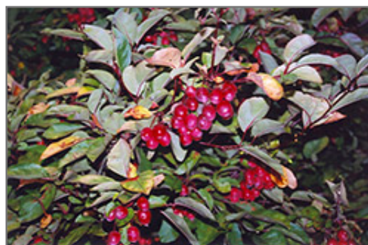
Adams Flowering Crab fruit