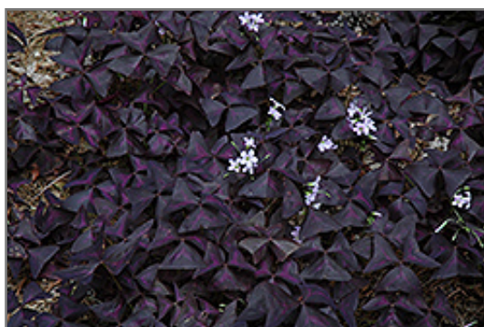
Purple Shamrock foliage