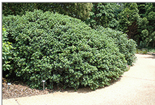
Roundleaf False Holly