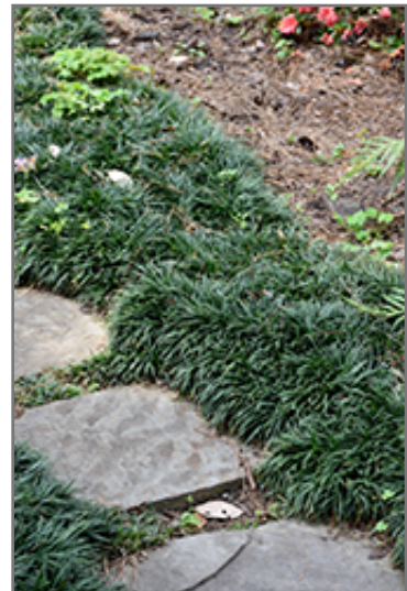
Dwarf Mondo Grass