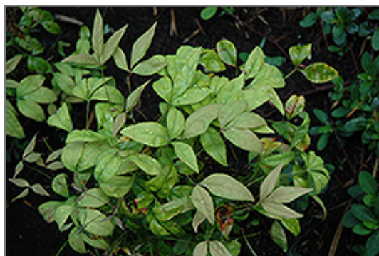
Pygmy Nandina foliage