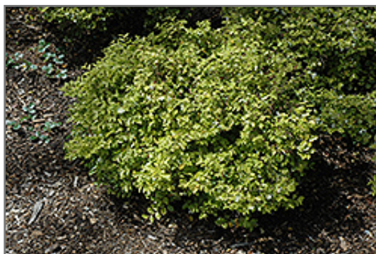
Snow Dance Fringeflower in bloom