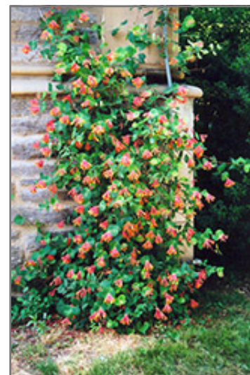
Superba Trumpet Honeysuckle in bloom