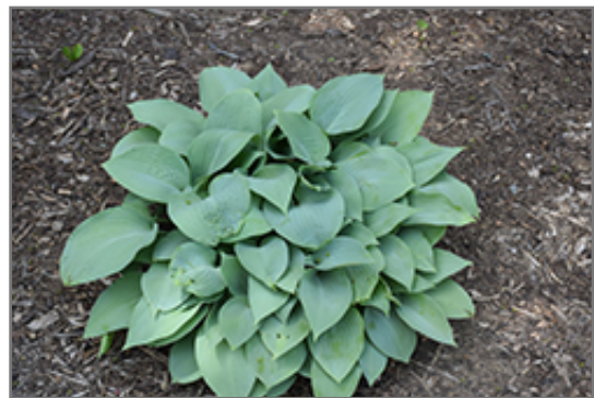
Carolina Blue Hosta