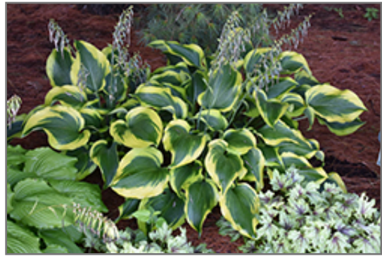
Atlantis Hosta