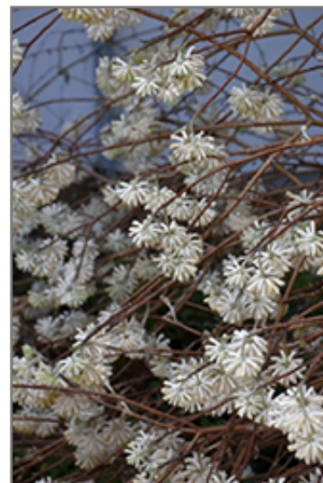
Oriental Paper Bush flowers