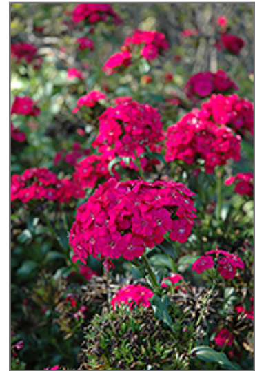
Amazon Neon Cherry Pinks flowers

Amazon Neon Cherry Pinks is recommended for the following landscape applications;