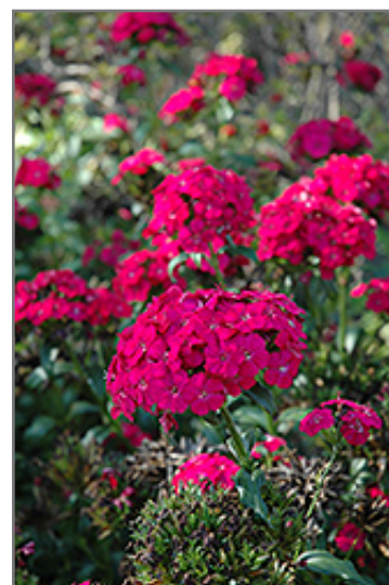
Amazon Neon Cherry Pinks flowers

Amazon Neon Cherry Pinks is recommended for the following landscape applications;