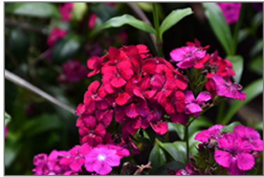
Amazon Neon Cherry Pinks flowers

Amazon Neon Cherry Pinks will grow to be about 30 inches tall at maturity, with a spread of 15 inches. When grown in masses or used as a bedding plant, individual plants should be spaced approximately 12 inches apart. Its foliage tends to remain dense right to the ground, not requiring facer plants in front. Although it's not a true annual, this plant can be expected to behave as an annual in our climate if left outdoors over the winter, usually needing replacement the following year. As such, gardeners should take into consideration that it will perform differently than it would in its native habitat.