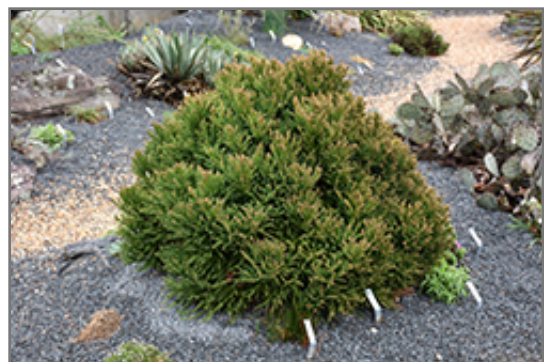
Little Diamond Japanese Cedar