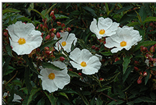
Blanche White Rockrose flowers