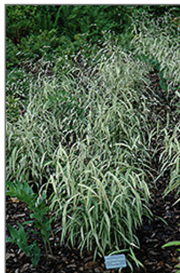
River Mist Northern Sea Oats