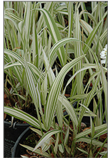
River Mist Northern Sea Oats foliage

River Mist Northern Sea Oats is a fine choice for the garden, but it is also a good selection for planting in outdoor pots and containers. Because of its height, it is often used as a 'thriller' in the 'spiller-thriller-filler' container combination; plant it near the center of the pot, surrounded by smaller plants and those that spill over the edges. It is even sizeable enough that it can be grown alone in a suitable container. Note that when growing plants in outdoor containers and baskets, they may require more frequent waterings than they would in the yard or garden.