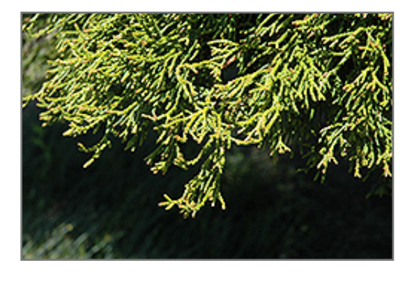
Coralliformis Dwarf Hinoki Falsecypress foliage

Coralliformis Dwarf Hinoki Falsecypress is recommended for the following landscape applications;