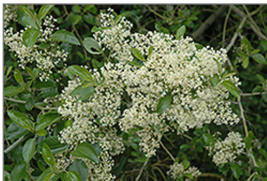
Coast Whitethorn flowers