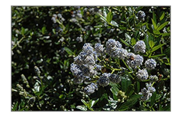
Bonnie Doon California Lilac in bloom

This shrub does best in full sun to partial shade. It prefers dry to average moisture levels with very well-drained soil, and will often die in standing water. It is not particular as to soil type or pH. It is somewhat tolerant of urban pollution. This particular variety is an interspecific hybrid.