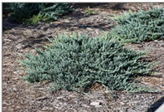
Blue Chip Juniper