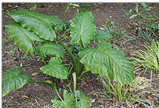
Elephant's Ear