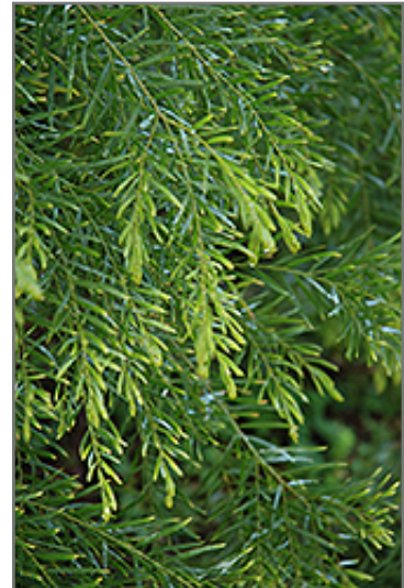
Silver Sheep's Burr foliage