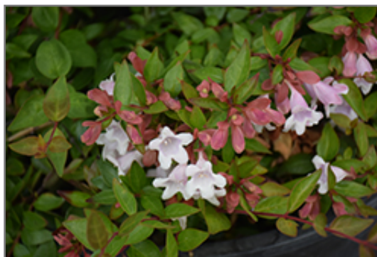
Edward Goucher Abelia flowers

Edward Goucher Abelia is recommended for the following landscape applications;