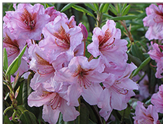
Kabarett Rhododendron flowers