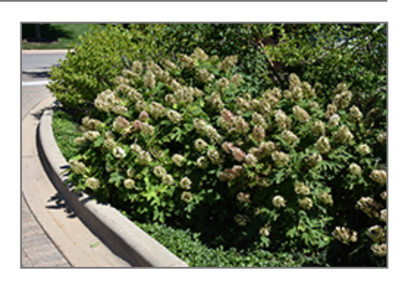
Snow Queen Hydrangea in bloom