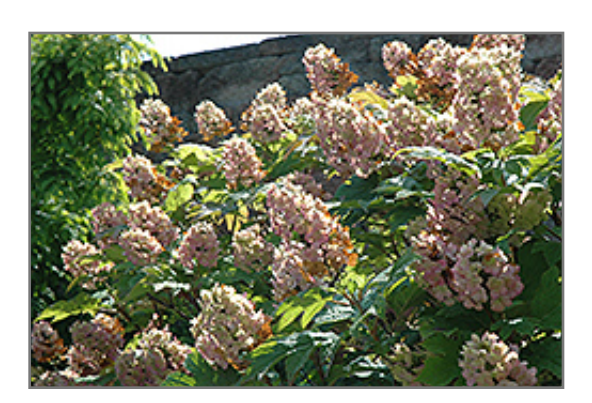
Snow Queen Hydrangea flowers