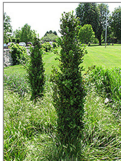
Graham Blandy Boxwood