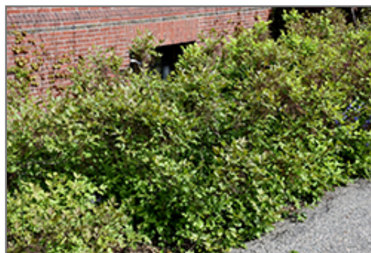
Shrub Yellowroot