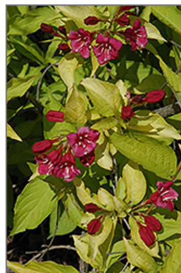
Rubidor Weigela flowers