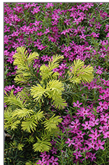
Watnong Gold Yew foliage