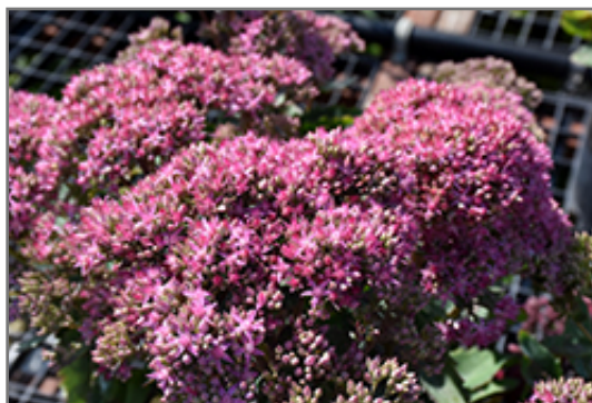
Bon Bon Showy Stonecrop flowers

Bon Bon Showy Stonecrop is recommended for the following landscape applications;