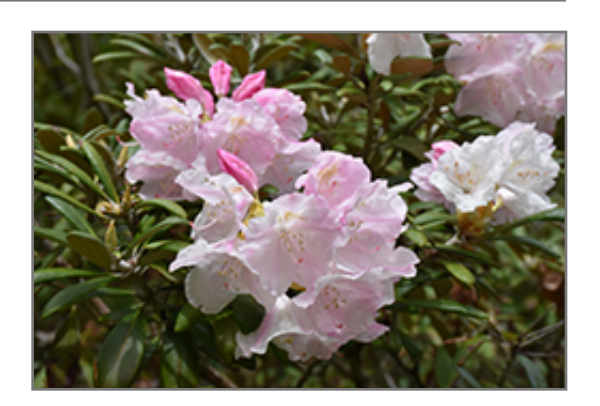
Mist Maiden Rhododendron flowers

Mist Maiden Rhododendron will grow to be about 4 feet tall at maturity, with a spread of 4 feet. It tends to be a little leggy, with a typical clearance of 1 foot from the ground. It grows at a slow rate, and under ideal conditions can be expected to live for 40 years or more.