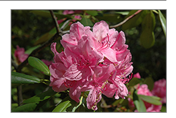
Pinnacle Rhododendron flowers

Pinnacle Rhododendron will grow to be about 5 feet tall at maturity, with a spread of 5 feet. It tends to be a little leggy, with a typical clearance of 1 foot from the ground, and is suitable for planting under power lines. It grows at a slow rate, and under ideal conditions can be expected to live for 40 years or more.