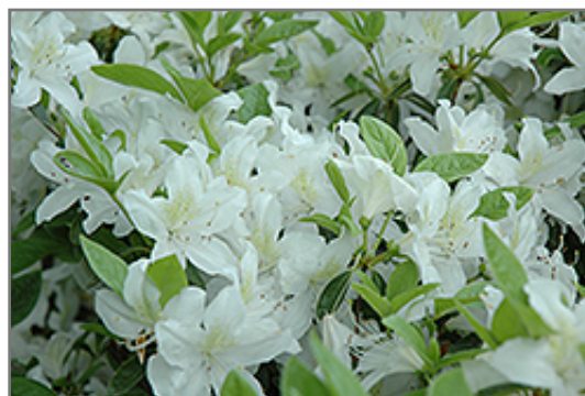
Palestrina Azalea flowers